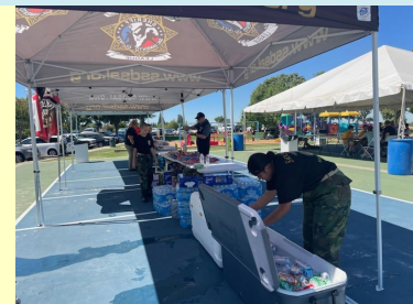
Ready to go for UIC