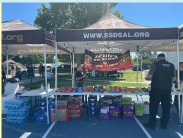
UIC Set Up