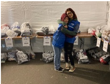
Florin Law Academy Seniors

Multiple SAL youth members from the Florin High School Law Academy (FLA) and the Young Marines assisted in the preparation and execution of California's best marathon- the CIM- the weekend of December 4th and 5th.