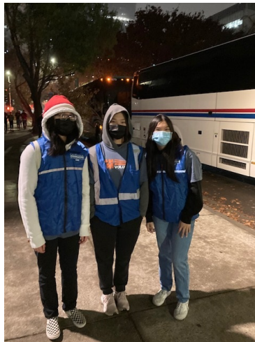
Florin Law Academy Juniors