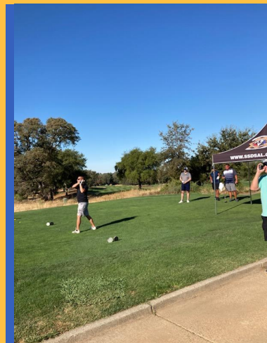
SAL Board of Directors