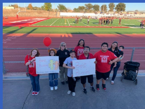
Antelope Best Buddies enjoyed cheering on their home team at the Homecoming game on September 30th.