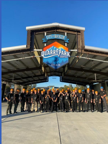
Quarry Park Adventures