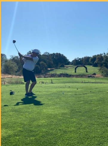
Through Arch Way = Winner!