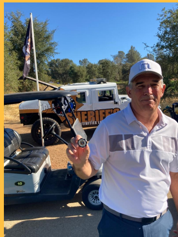
Proof it could be done!