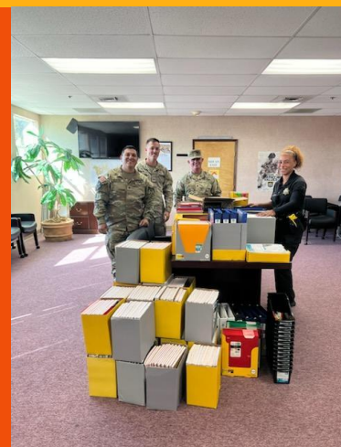
DELIVERY TO DCA