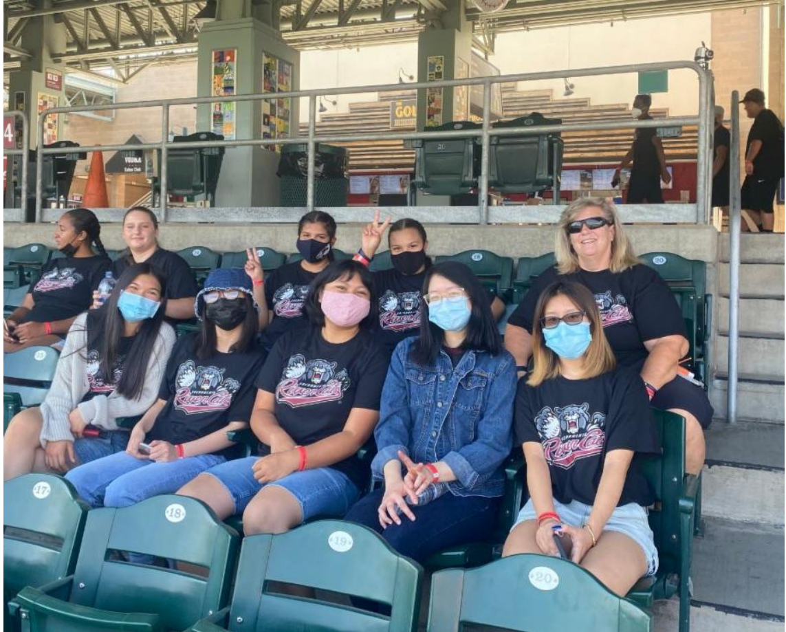
SAL would like to thank EGSROs, the Community Relations Unit (CRU), and Sheriff's Office personnel for helping make the event a success!