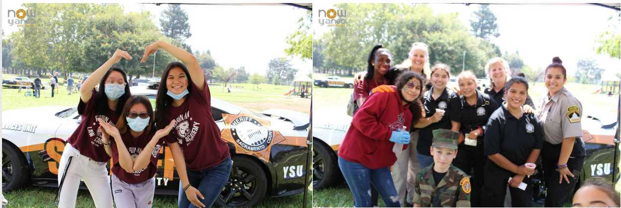
YOUTH LEADERSHIP COUNCIL, SACRAMENTO SHERIFF'S EXPLORERS, & FLORIN LAW ACADEMY