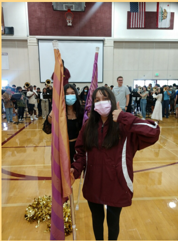
FLA Seniors representing at the first assembly of the year