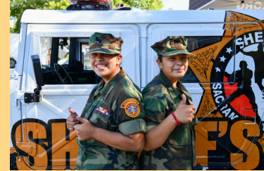
Young Marines at Unity in the Community