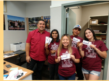
FLA Seniors win big with free slurpies from 7-11