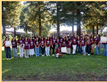
Shout out to Florin Road Krispy Kreme for donating enough donuts for the entire Florin Law Academy