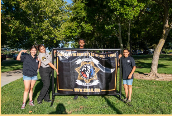
The YLC crew at UIC