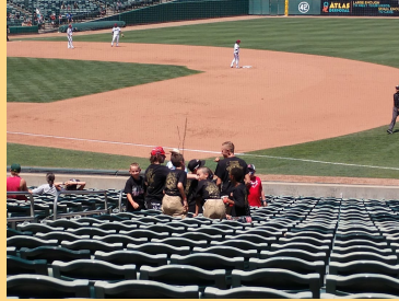
Young Marines looking for a foul ball at the River Cats game