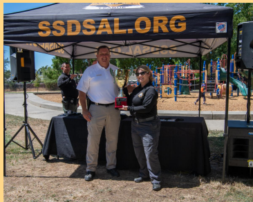
Congrats Re-Entry on being the "People's Choice" booth winner