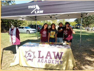
FLA booth at UIC at Rutter Park