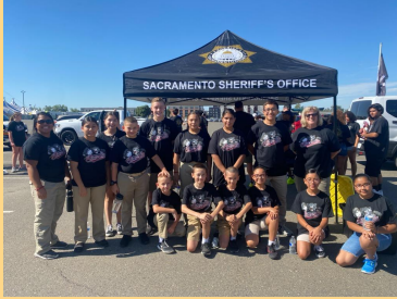
Young Marines proudly representing SAL at the River Cats game