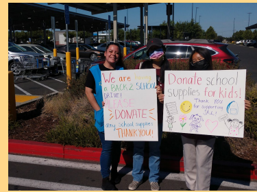
FLA Seniors showing support at the supply drive