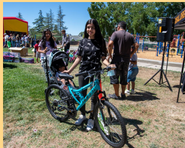
Community member is all smiles after winning a free bicycle