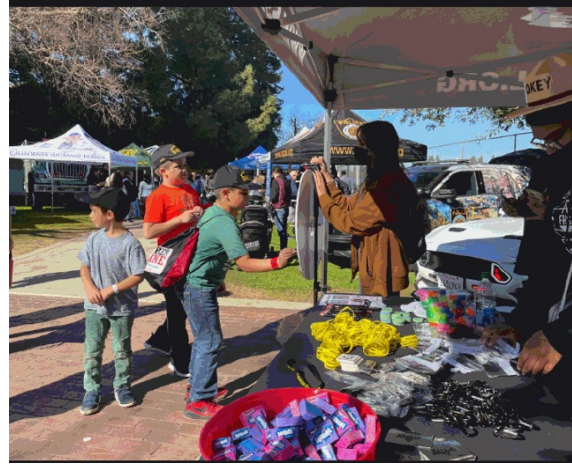
Spinning the Prize Wheel