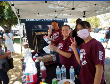
Unity in the Community