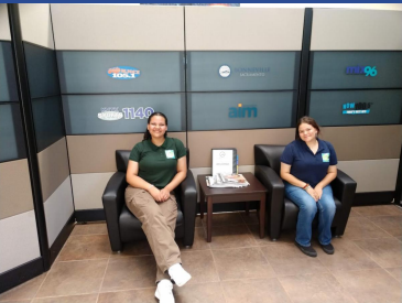
Bonneville Radio Station