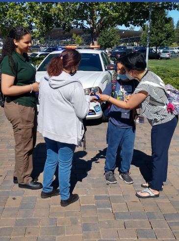
UCD M.I.N.D. Institute