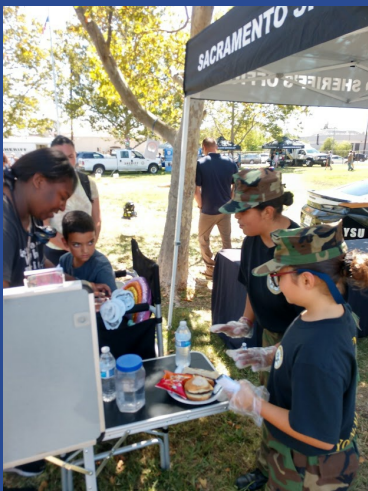
Young Marines ensuring everyone eats at UIC