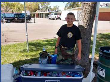
It's not easy keeping drinks cold on a 100 degree day but a Young Marine Cadet does his best at UIC