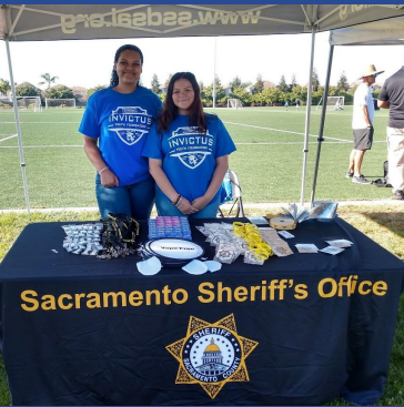
Invictus Soccer Camp