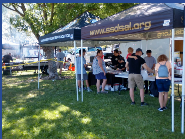
Young Marines keeping the food line stocked at UIC